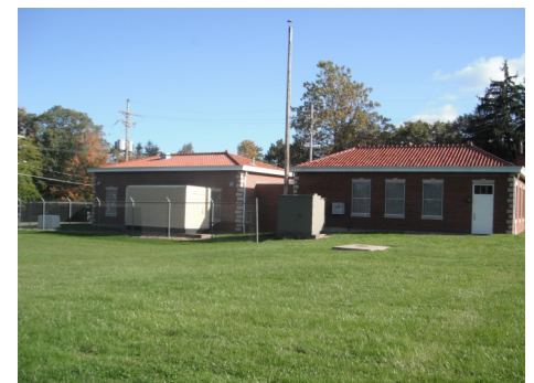
Cherry Street Pump Station

plant. The project will include a new laboratory, control room, and restoration of all concrete and brickwork. The iconic dome that sits atop this facility will be refurbished to maintain the architectural integrity of this historical building.