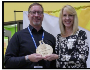
EWW received a Bread Box Award from the Second Harvest Food Bank

Erie Water Works’ employees donate $2.00 each Friday to wear jeans. In 2019 those donations went to a number of local organizations including the Second Harvest Food Bank, American Heart Association, Meals on Wheels, and the Luther Jones Family Fund. Donations leading up to Christmas were designated to shop for four needy children identified through Community Shelter Services.