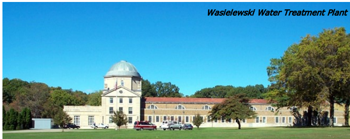
Wasielewski Water Treatment Plant

A sizable portion of the investment will be made at the Richard S. Wasielewski Water Treatment Plant, EWW's primary filtration facility. Originally constructed in 1932, the 'Phase 3 Facility Improvements' will restore the structural and architectural elements of the Plant, add a new state-of-the-art laboratory, and update electrical and HVAC systems in order to modernize the buildings. Construction bids will be received in April.